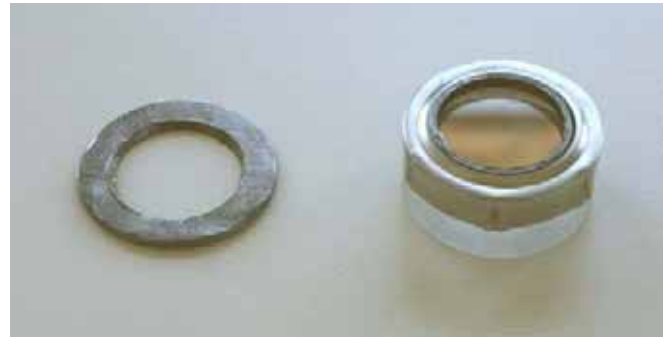
Repair Kit Assembled

Fossil Steam Technologies Ported Boiler Level Gauge Repair Kit (P/N: 9320-0109) is a high quality replacement for the Fossil Steam Technologies Aquarian 3000V (Visual) High Pressure Bi-Colour Gauge. A kit to repair Yarway Bi-Colour ported gauges is available under part number P/N: 9320-0100. Both repair kits are rated for 3000 psi saturated steam service.